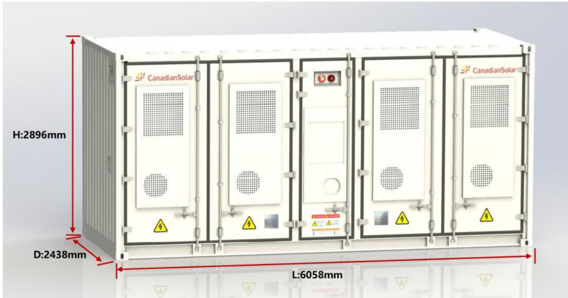
Figure 1. Dimensions of the Solbank Container